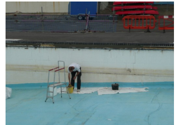
Working together to create a new Hilsea Lido, from left: Creating a new gate access; Widening the entrance with the support of Colas; Removing the rapidly growing algae; Repairing the pool surface.