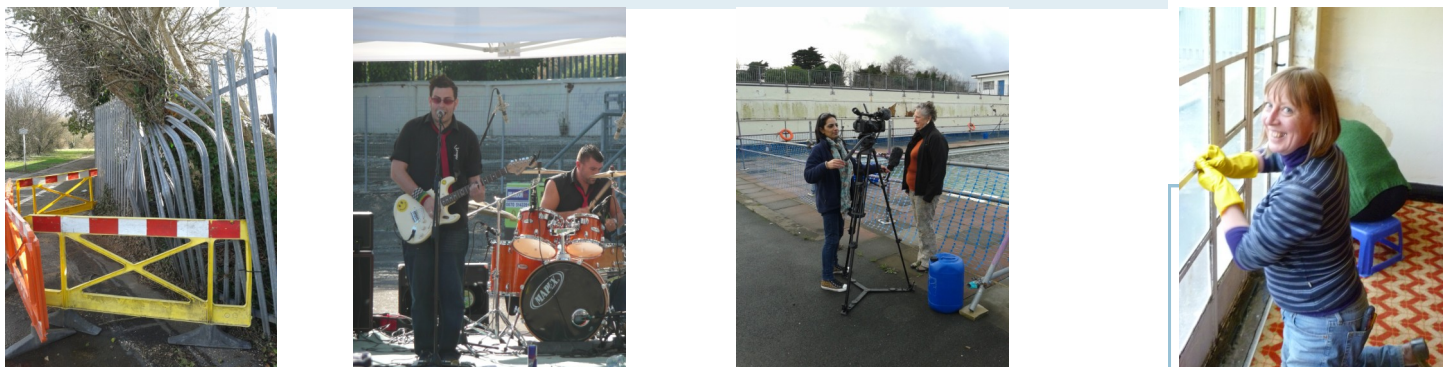
Working together to create a new Hilsea Lido, from left: Removal of fallen trees with the support of Portsmouth City Council; Fundraising at Live@theLido, supported by a variety of local musicians; Spreading the word via media support; Preparing for painting.

The Trust will be focussing on the practicalities of the management of Hilsea Lido and gaining feedback on what people want from this facility and how the Trust can best deliver its objectives. The Lido buildings continue to be renovated thanks to our volunteers, they have recently been working to remove old Georgian wired glazing from the original Crittall windows and replace with polycarbonate panes, painting of the outside of the building and make the site look presentable. The paint has been donated by a local company and the Trust will continue to improve the buildings as best it can. The lack of revenue support, which is provided to other organisations within the city, certainly limits the speed of these improvements and creates additional challenges for the Trust. In addition the lack of working capital to pay for electricity, water, sewage, accountancy, chemicals, training, etc. hinders the purchase of building materials and expertise. Managing people's expectations under these difficult circumstances adds to the Trust's challenges.