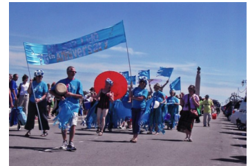
Working together to create a new Hilsea Lido, from left: Completing a pipe survey with the support of Bam Nuttall; Creating a site surround freize with local schoolchildren, supported by Covers; Ceaning & organising the working areas of the Blue Lagoon; Taking part in events to keep people informed.

The considerable progress the Trust has made since 2010 is due to the support it has gained from grant funders, local businesses, the probation service and most of all determined and committed volunteers. To date the social capital and grant funding invested in Hilsea Lido amounts to a considerable sum and this demonstrates the desire from local people to have their lido re-opened. The Trust has always worked towards providing the next generation with the same opportunities many of them experienced in their youth. HLPPT gains inspiration through the school children of this city who are looking forward to Hilsea Lido being open again. The particular interest of young people is often diving (jumping into the water) as well as swimming. In addition to our own consultations with young people and the widespread attention the sport has gained through the popularity of diving champions such as Tom Daley, we were alerted to this recently when it was widely reported that 200 children went to a diving squad selection event at Southampton. Twenty children were selected for the squad but sadly 180 keen divers were left without the opportunity to access facilities to develop their interest in this high profile and growing sport.