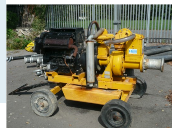
Working together to create a new Hilsea Lido, from left: Cleaning the pool with the support of Cosham Fire Service; Cleaning out the plant room with the support of Army Cadets; Repairing the scum channel; Pumping out pool supported by Selwood.

Eventually Hilsea Lido, which had been designed as a premier venue hosting gala events, will be fully restored complete with high board diving facilities to provide families and young adults with a social and educational hub. The site will provide employment for around 30 part-time and two full-time posts. However the time-scale for this process entirely depends on the resources available to the Trust.